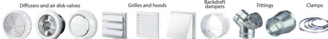
Diffusers and air disk valves