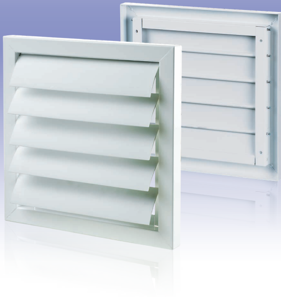
Ventilation grille with gravity shutters